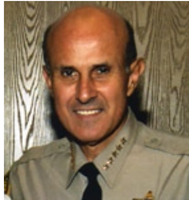
Sheriff Lee Baca, Los Angeles County Sheriff's Department